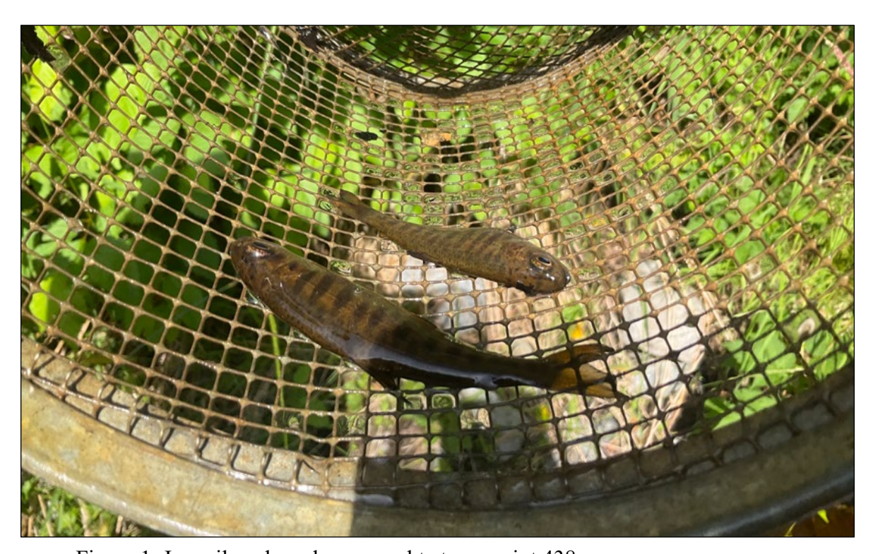
Figure 1. Juvenile coho salmon caught at waypoint 438.