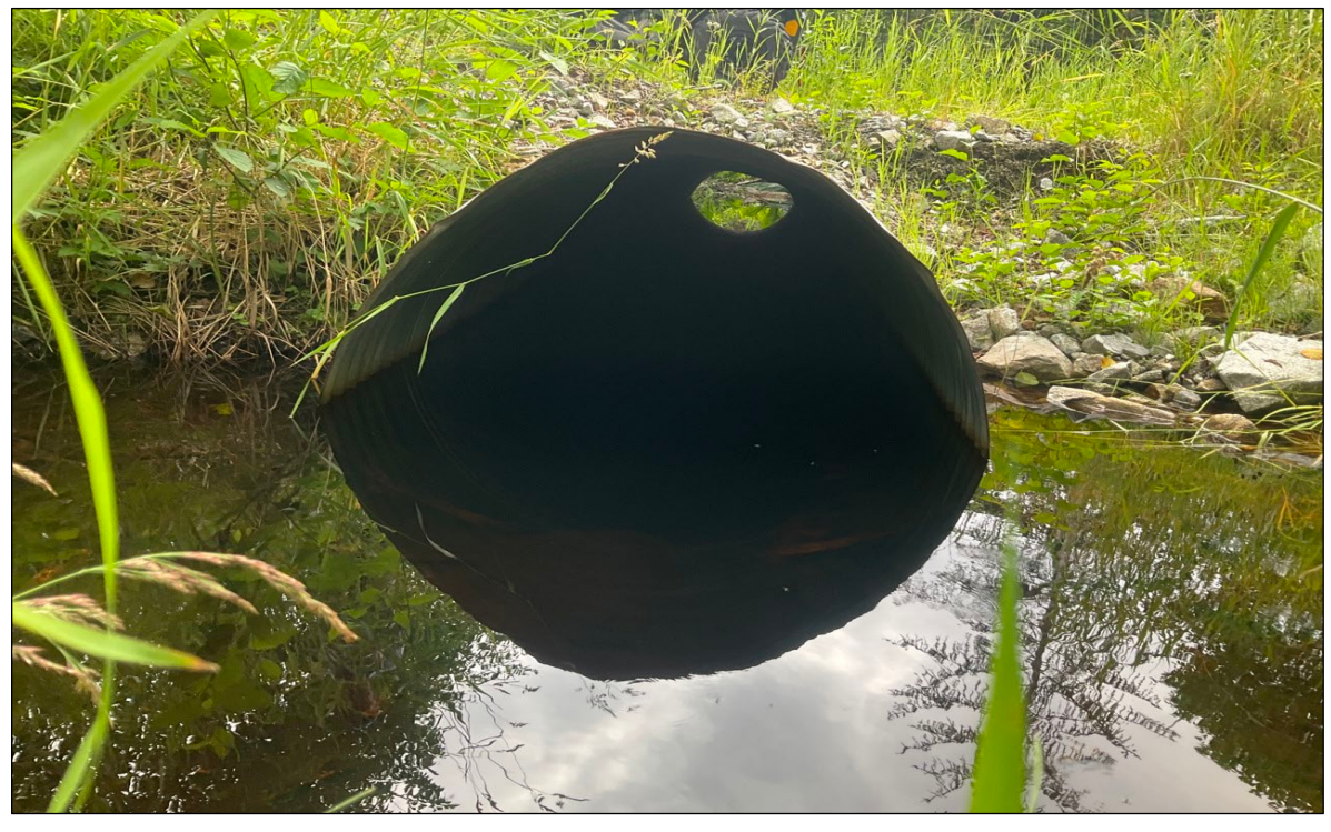
Figure 3. Culvert inlet looking downstream at waypoint 438.