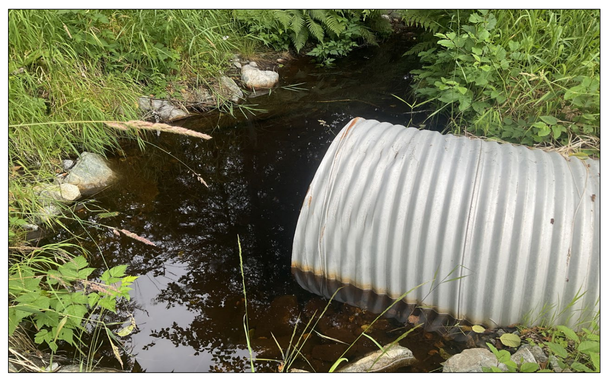
Figure 2. Culvert inlet at waypoint 438.